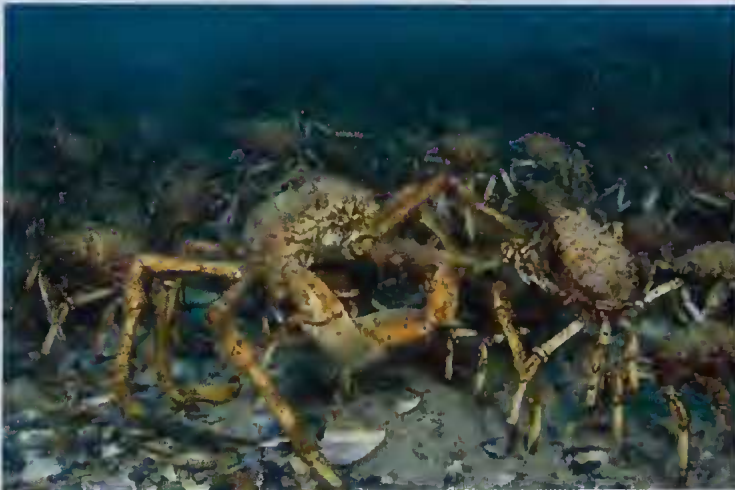
Giant Spider Crabs swarm in Port Phillip Bay.

This guide is a practical and comprehensive guide for the amateur and professional naturalist